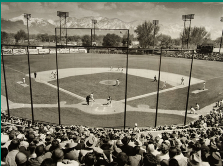
Derks Field, 1958