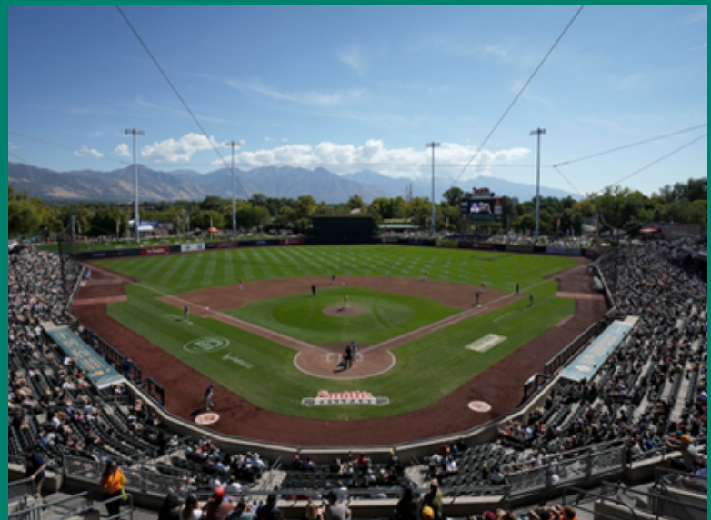
Smith's Ballpark, c. 2023