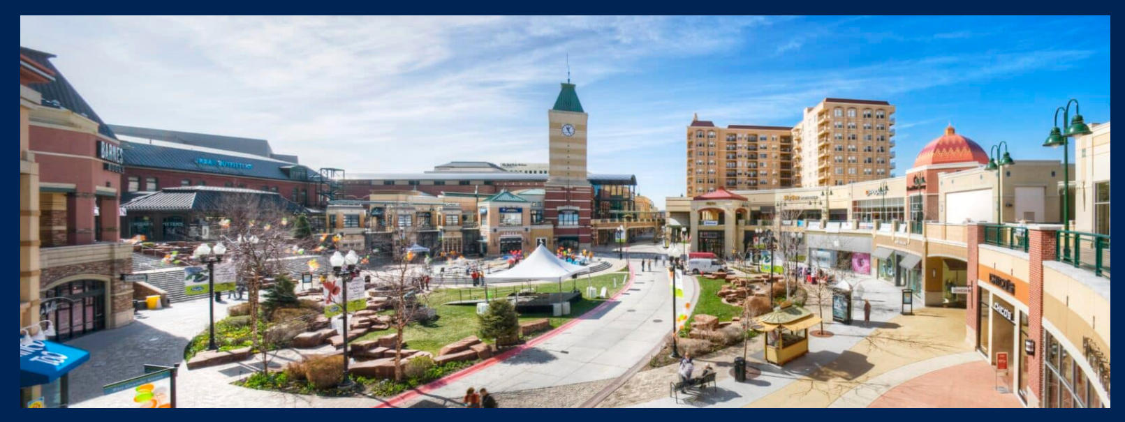
The Gateway of old, featuring Barnes and Noble, Urban Outfitters, and Utah's first Apple Store.